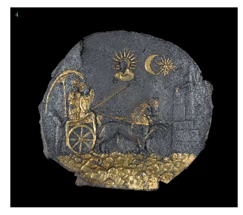
FIG 4 Ceremonial plaque depicting Cybele (Aï Khanum, temple with niches), gilded silver, beginning of 3rd century BC (cat. 23)

One of the oldest antiquities found at Aï Khanum is a ceremonial plaque made of gilded silver (fig. 4). It depicts Cybele, Greek goddess of nature, riding in a chariot. Next to her is the winged goddess Nike, holding the reins. The chariot is drawn by two lions passing through a mountainous landscape strewn with rocks and flowers. Cybele is attended by two priests: one behind, holding a parasol, and the other standing on a tall altar, making an offering. Three heavenly bodies shine down from the sky: the sun god Helios, a crescent moon, and a star. In sum, the plaque shows the goddess of nature presiding within an orderly cosmos.